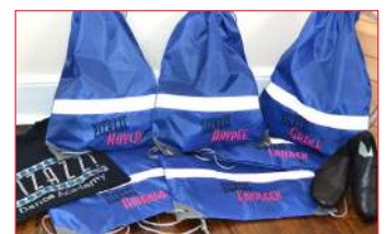
Name Drop: Quickly insert several names in a single design for bags, caps, badges or shirt logos.