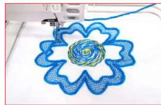
Couching: Add depth, dimension and drama to any project by stitching down yarn.