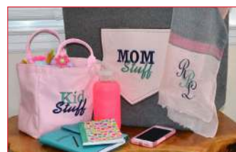
Intertwined Monogram: Easily weave your monogram letters through each other, creating a unique design.