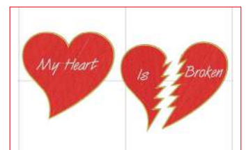
Knife Tool: Use the knife tool to cut away parts of the design.