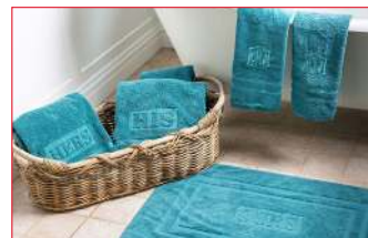
Reverse Lettering: Use alongside Netfill and Trim functions to eliminate bulky satin stitches that could easily get lost on bulky fabric.