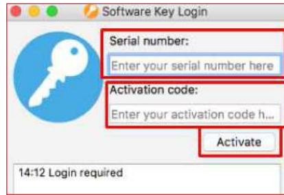
Software key login: Install the software an unlimited number of times, log in to use at any time.