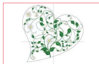
Automatic Floral Design Fill: Dynamically create beautiful floral filled shapes.