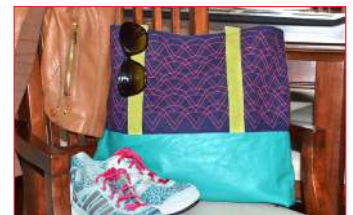
Array: Take a single design and automatically populate it seamlessly into several, covering your stitch area.