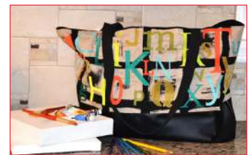
Fonts, Fonts Fonts: Select from True Type Fonts, Open Type fonts, or your system fonts to create unique looks.