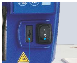
USB port — power switch

The operation panel is equipped with ease with many different functions.