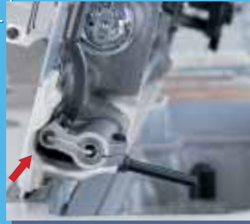
Feed eccentric pin

In addition, the machine is provided with a mounting seat for attachment to improve workability while replacing the attachment and increasing the durability of the machine bed surface.