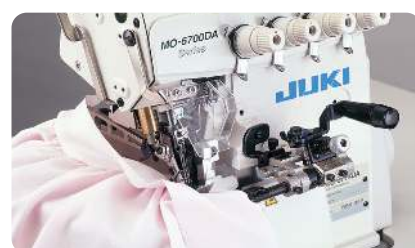
Gathering MO-6714DA-BE6-327/S162 (S162: Swing-type gathering device, manual-lever operated)