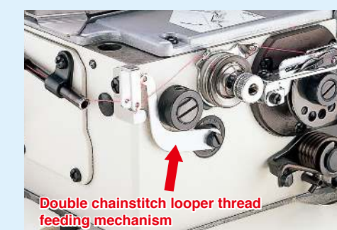
Double chainstitch looper thread feeding mechanism