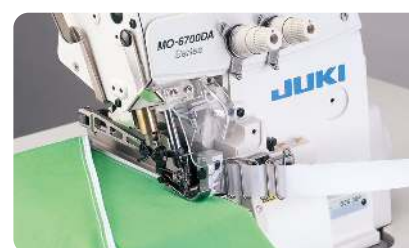
Rolling in tape MO-6745DA-FF4-360/N077 (N077: Clean finish top and bottom)