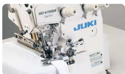
Blind hemming MO-6705DA-0D4-210/L121 (L121: Blind stitch hemming attachment)