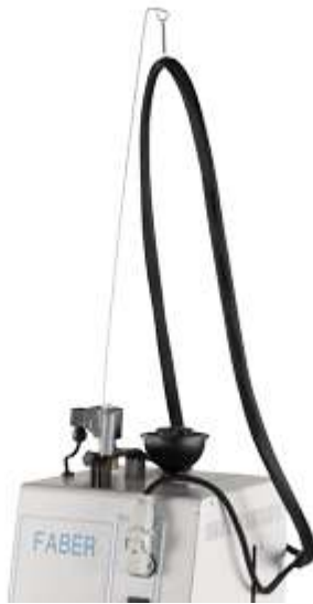
Cable holder rod