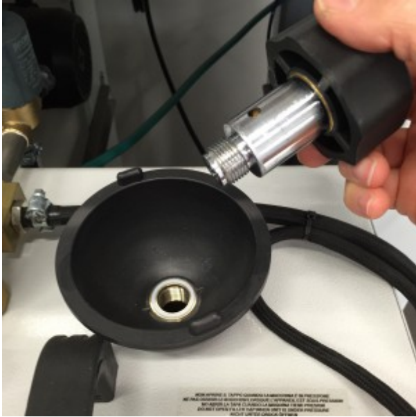
Built-in refill funnel