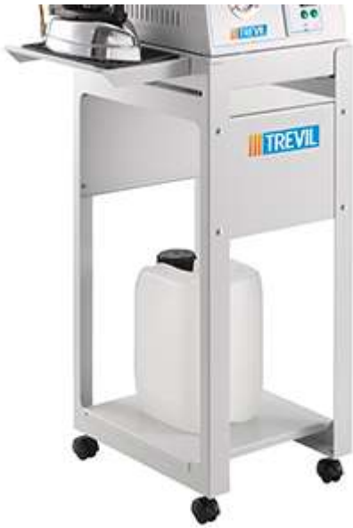
Refill tank included