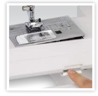
ONE-STEP NEEDLE PLATE