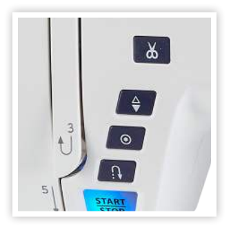
AUTOMATIC THREAD CUTTER