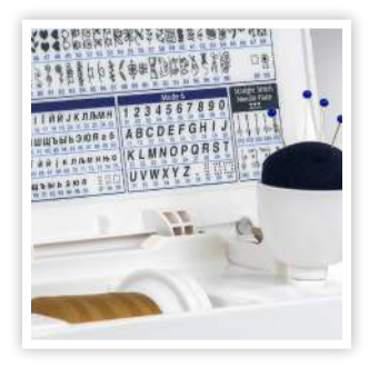
196 STITCHES, UP TO 9MM WIDE