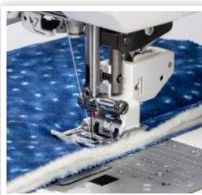
ACUFEED FLEX FABRIC FEEDING SYSTEM