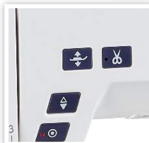
AUTOMATIC PRESSER FOOT LIFT