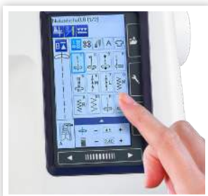
TOUCH SCREEN WITH 13 LANGUAGES